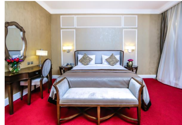
Two Bedroom JUNIOR SUITE 78M 2