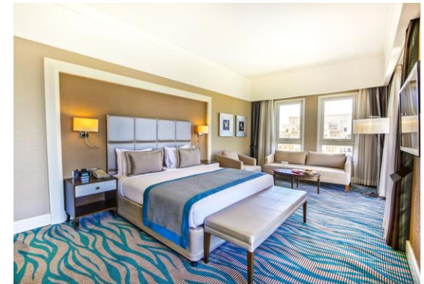
DELUXE ROOM 32-37 m 2