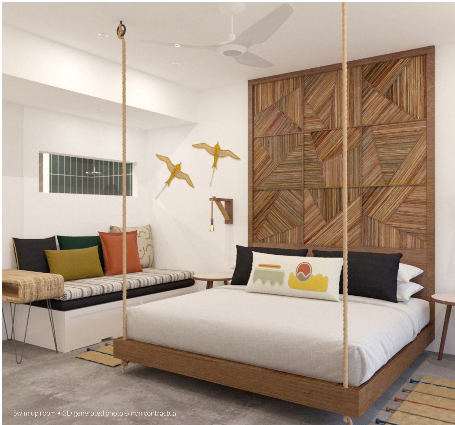
Swim up room • 3D generated photo & non contractual